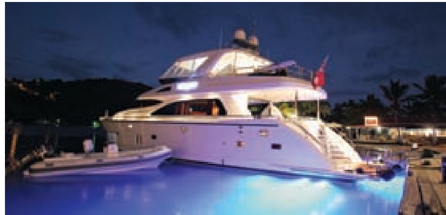
Moored outside Sydney's on Jost van Dyke

Running back down the north side of the island chain takes you past Great Camanoe and Guana, and it’s worth stopping in at marina Cay and Trellis Bay, particularly the latter where