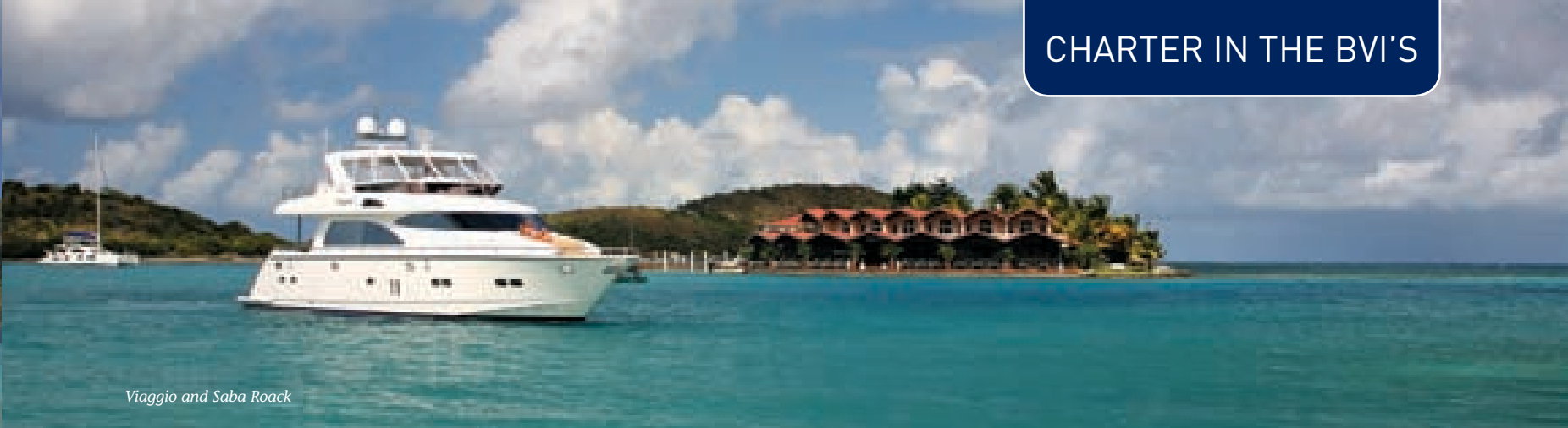
Viaggio and Saba Roack