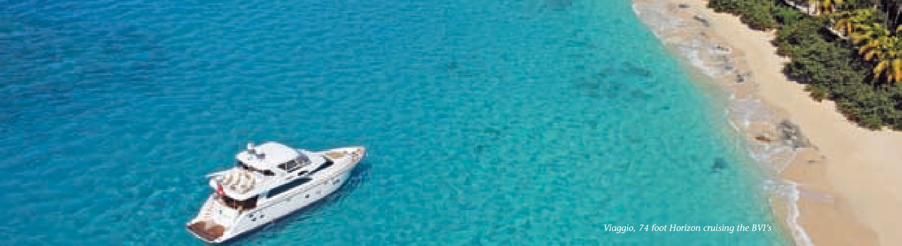
Viaggio, 74 foot Horizon cruising the BVI's