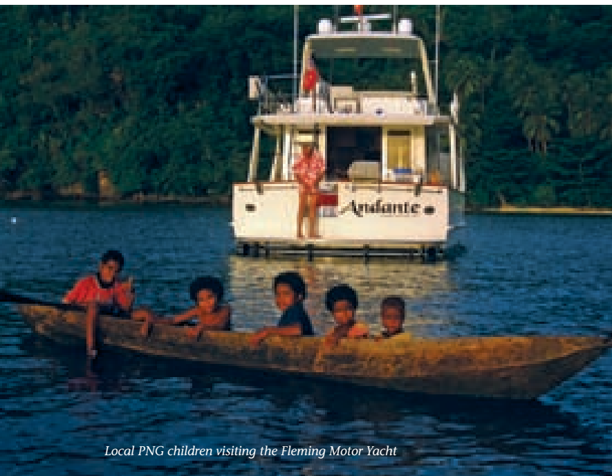
Local PNG children visiting the Fleming Motor Yacht

ANDANTE is a Fleming 55 Pilot House Motor Yacht 18 m long with 2 x 500 hp Cummins engines. The hull is semi displacement with a max speed of 18 knots. The comfortable passage-making speed is 8 – 10 knots. Fuel capacity is 3800 litres that can be extended to 5400 litres with 2 x 800 litre fuel bladders.