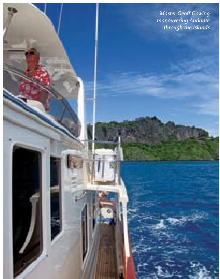
Master Geoff Gowling manoeuvring Andante through the islands

On most occasions we were also able to help supplement their food supplies with fish we had caught when moving from island to island. As we had caught the fish (usually Spanish Mackerel, Tuna or King Snapper) in their own local waters we handed them over to the local people as a gesture of goodwill. It was always much