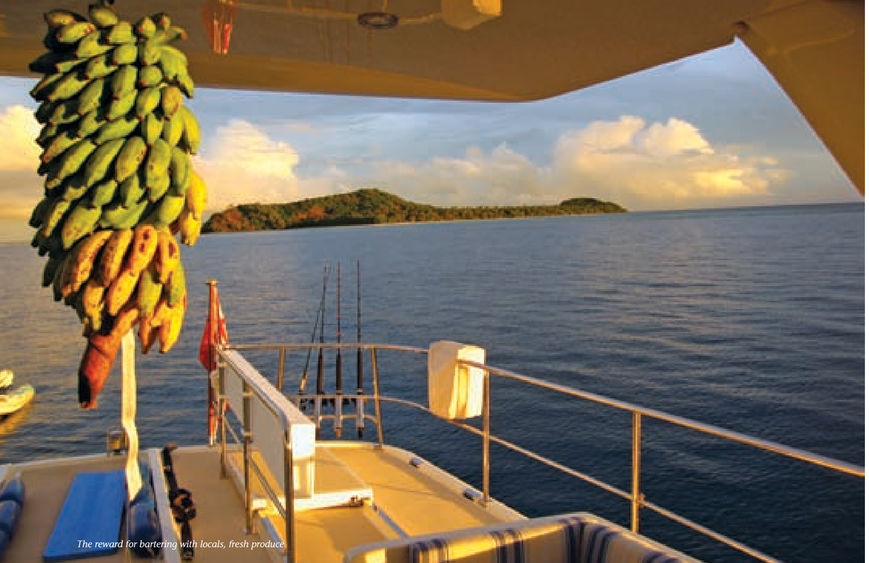
The reward for bartering with locals, fresh produce